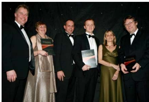
The category winner and runners up